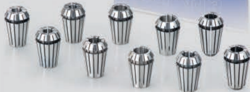
三刃專用 for 3 Flute End Mill